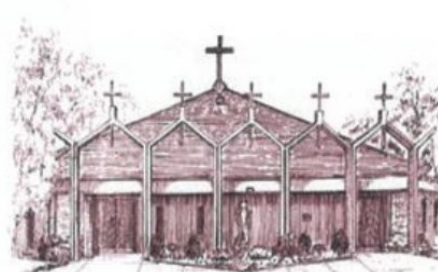
ST. HUBERT CATHOLIC CHURCH