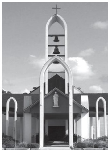
ST. PETER CATHOLIC CHURCH